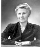
Many Voices, One Journey, p. 12

It’s true that I decided I needed to take the Twelve Steps for myself, my dear, but no matter what you read about me, just remember that I didn’t feel better overnight; it took a while, and once Al-Anon was up and running, I didn’t have to do it alone.”